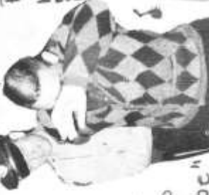
"I got 400 Babe"