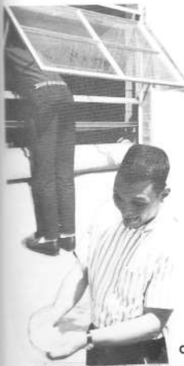
Look in any window