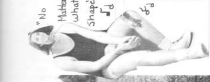
"No Matter what Shape"