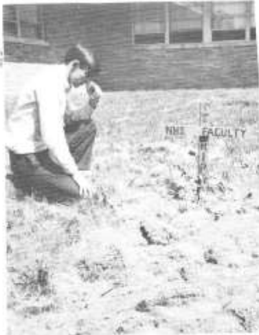
Don't tread on me!