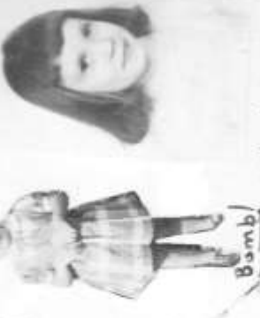
Well, Hello there