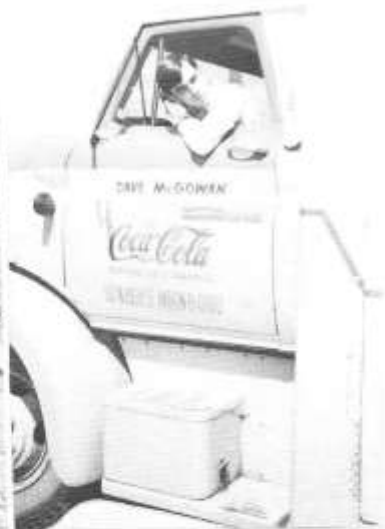
We cater senior (?) parties!