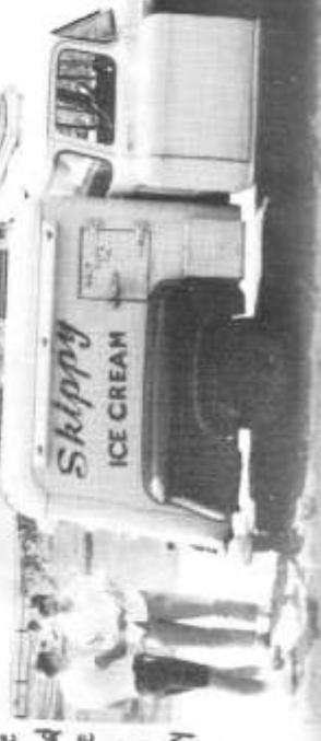
Take Good Care of my Baby