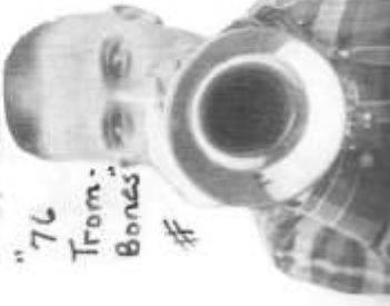
"76 Trom: Bones" #