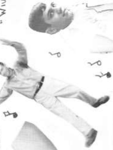
"Beer Barrel Polka"