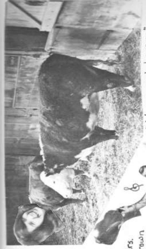
"Wives and Lovers"