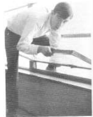
And they said I'd never get out